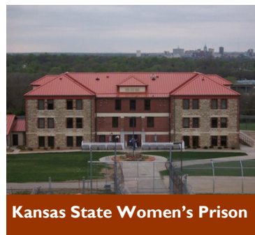
Kansas State Women's Prison